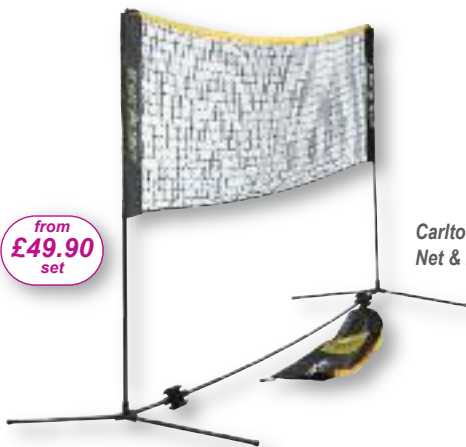
Carlton Put Up Net & Posts