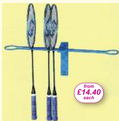
Carlton Primary Education Set