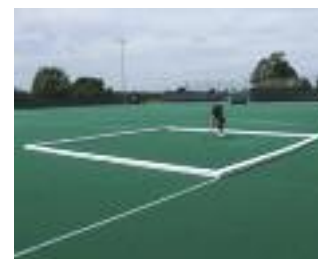
Divide small areas