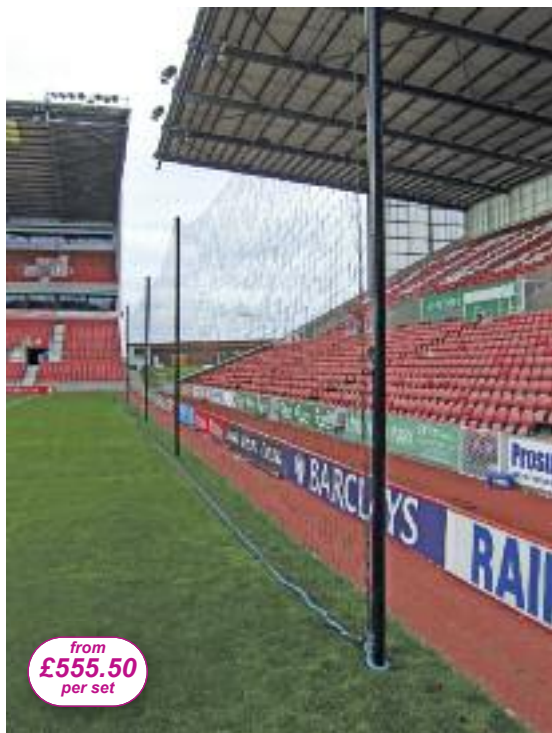
Crowd Protection Ball Stop System