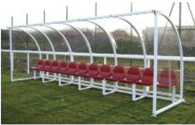
6m Shelter Front View