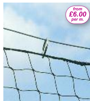
Pitch divider netting showing Pitch Divider Wire and Split Rings