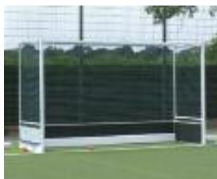
Protect goal backboards