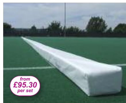
Hockey Pitch Divider