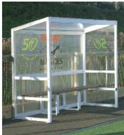
2.5m Aluminium Team Shelter 5 Person