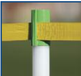
Cap with webbed strap