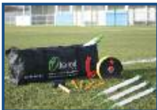
Complete with carrybag