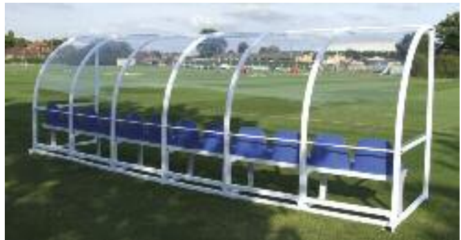
6m Shelter Rear View